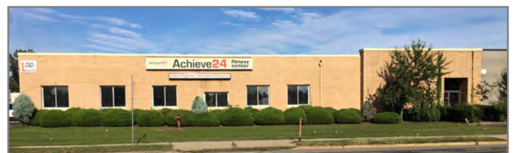
475 Boulevard, Elmwood Park

Available Space: 2,925 sf Office: 810 sf Ceiling Height: 25' Loading: 2 drive-ins