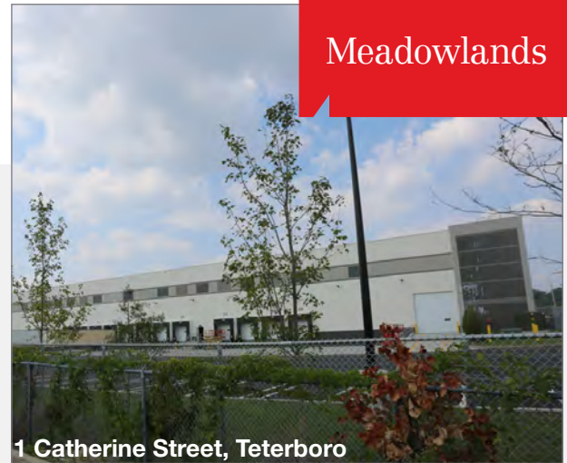
1 Catherine Street, Teterboro

1 Catherine Street in Teterboro, a 156,256 square foot building, sold from Catellus Development Corporation to Duke Realty Corporation. The property has been fully leased to Lindenmeyr Munroe since 2015. It sold for $35,500,000 or $227.19 per square foot.