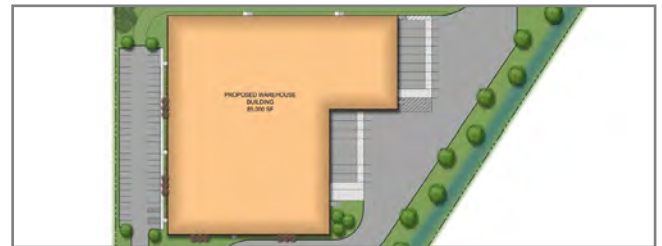
210 Clay Avenue, Lyndhurst